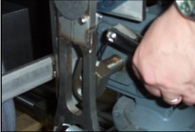
Loosening the set screw with the 1/8 allen wrench.

22. Once the drive hub bolt & bearing are removed, loosen the set screw on the drive hub. There is no need to remove it.